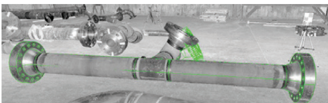
Fabricated spool doesn't match design