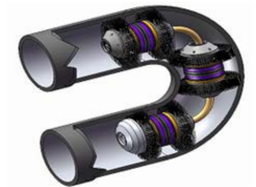
Figure 1. Smart Pig Navigating Piping

PBF contacted Quest Integrity to perform an emergency follow up examination of the convection coils. Over the course of the next 24 hours, crews and inspection tools were mobilized to the Delaware City Refinery.