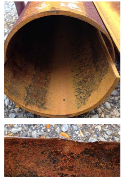
Figure 2. Tube with sulfidation corrosion (cut open)