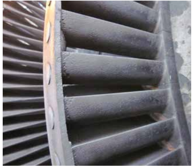
Corrosion damage on geothermal steam turbine blades