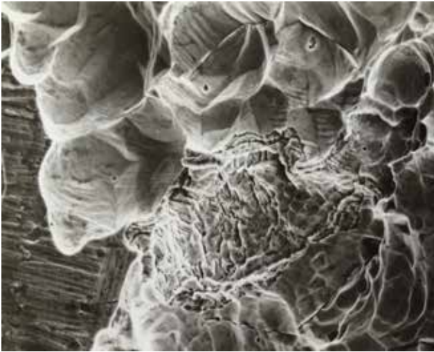
Pitting and stress cracking on stainless steel

Effective implementation of a corrosion management plan will allow potential challenges to the asset such as aging, changes in feed/product specification or operating conditions, to be properly mitigated. A corrosion management plan also provides a basic framework for review and audit of system performance and in the formulation of integrity operating windows (IOWs).