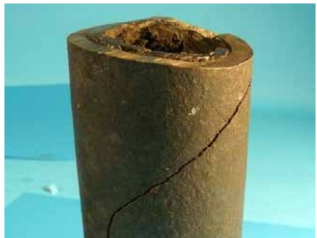
Cracking in a carburised tube, shutdown with an intact coke plug.