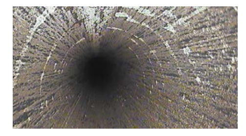
Figure 1. RVI visual images show the extent of the damage within the convection section of the piping.